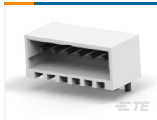
TE Part #5-1775443-8 AMP HPI 1.5MM HEADERS