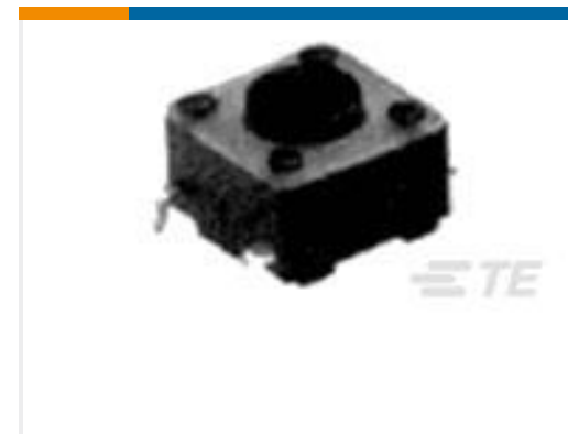
TE Part #1977223-4 FSM2JSMASSTR=6MM TACT SWITCH, SMT 160gf,