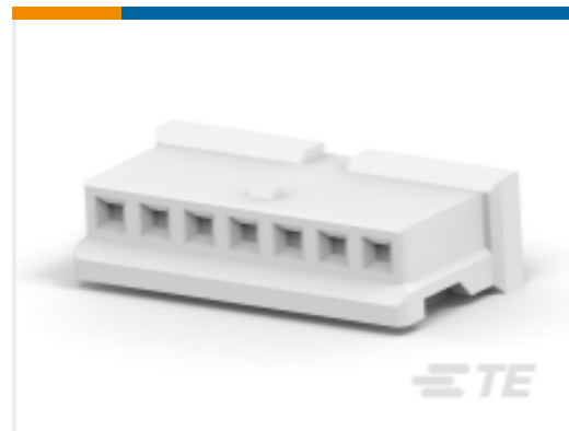
TE Part #1775441-8 AMP HPI 1.5MM RECEPTACLE HOUSINGS