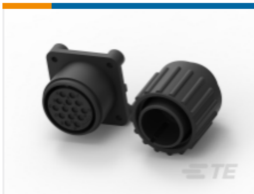
TE Part #213570-1 CPC MIL 5015