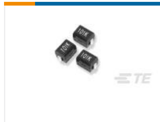
TE Part #1-1624094-2 3613C 2.2UH 10%