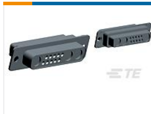
TE Part #5-208811-1 RECEPT ASSY, COAX MIX, AMPLIMITE