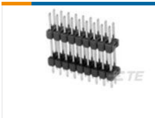
TE Part #4-146494-0 80 MODII HDR DRST UNSHRD STKG