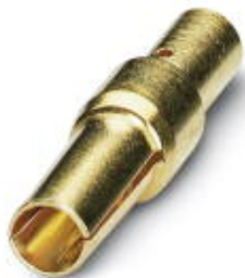
Crimp contact, turned, contact diameter: 2 mm, crimp range: 0.75 mm 2 ... 1 mm 2

Please be informed that the data shown in this PDF Document is generated from our Online Catalog. Please find the complete data in the user's documentation. Our General Terms of Use for Downloads are valid ( http://phoenixcontact.com/download )