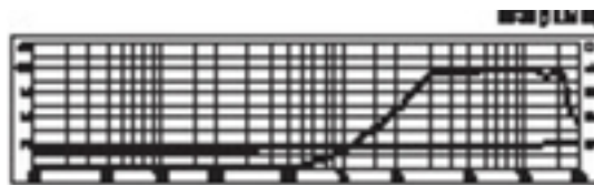
Miniature PA horn tweeter, 50 W, 8 Ohm