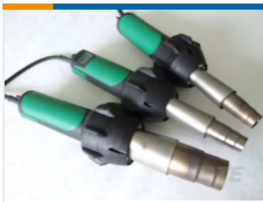
TE Part # EG1118-000 CV1981-ST-120V1600W-US