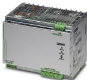
Primary-switched QUINT POWER power supply for DIN rail mounting with SFB (Selective Fuse Breaking) Technology, input: 1-phase, output: 48 V DC/20 A

Please be informed that the data shown in this PDF Document is generated from our Online Catalog. Please find the complete data in the user's documentation. Our General Terms of Use for Downloads are valid ( http://phoenixcontact.com/download )