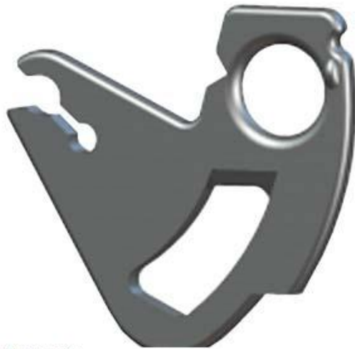
ACCES.F.FUSE SWI.DISCONNECTOR FOR NH000-NH3 LOCKING DEVICE