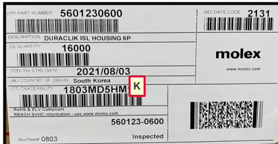
Carton label ( sample image)