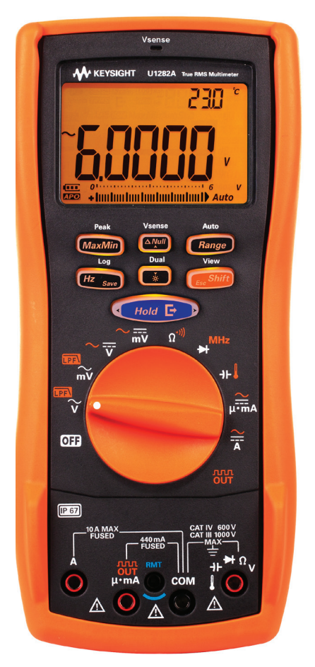
Figure 1. Large display and backlit keypad allow users to complete their jobs even in subdued lighting conditions.

Troubleshooting in most electrical environment is typically dangerous due to the high voltages involved. Now with the unique built in Vsense feature, you get a quick sense of AC voltage presence without the need to probe. When voltage presence is detected, it produces a unique combination of audible beeper alert and blinking LED light to alert users. This is especially useful to safeguard users from exposure to live wires, suspected AC voltage presence or simply an act of safety precaution before initiating a task. Work with a peace of mind knowing your safety comes first with Keysight's U1280 Series handheld DMM.