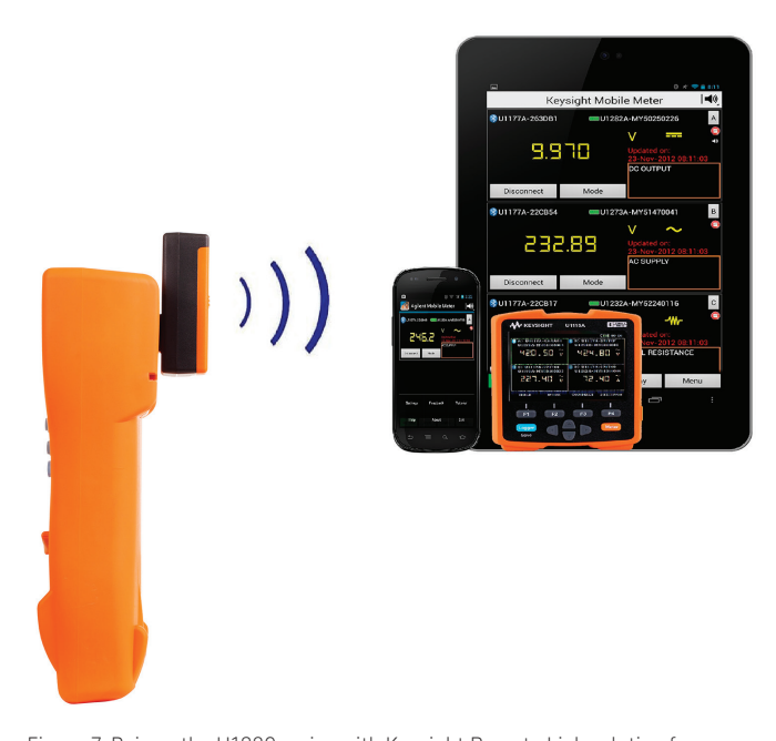
Figure 7. Pair up the U1280 series with Keysight Remote Link solution for wireless measurement option