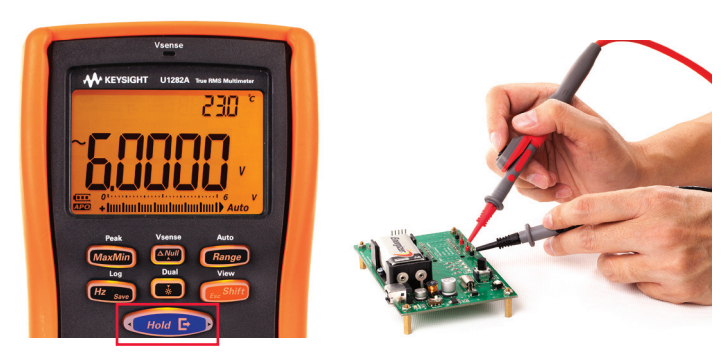
Figure 5. Hold & Export button—one press for three actions: Measure, save it into handheld DMM's memory and send the measurement out via infrared port. Optional U5404A remote switch probe emulates 'Hold & Export' button.

Keysight U1280 Series comes with programmability capability that allows avid programmer to create computer programs to control the handheld DMM. The programmability of Keysight U1280 Series allows users to automate Keysight U1280 Series or even integrate into bigger test systems.