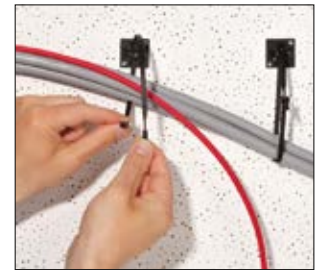
Without additional effort only Q-ties can be used for temporary and final cable bundling.