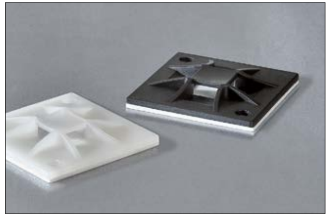
Q-Mount QM, 4-way entry, self adhesive, screwable.