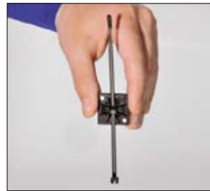
The Q-mount base locks the Q-tie in vertical position, leaving the hands free to apply the cables.