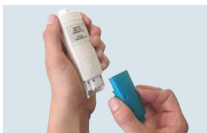
Easy exchange of probes with testo 206-pH1/-pH2/-pH3