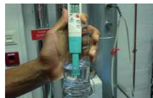
Ideally suitable for monitoring heating system water according to VDI 2035.