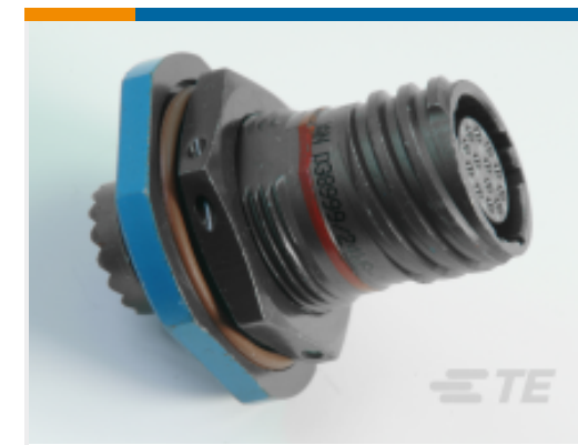
TE Part # YACT24JJ19PNC00100 JAM NUT RECEPTACLE