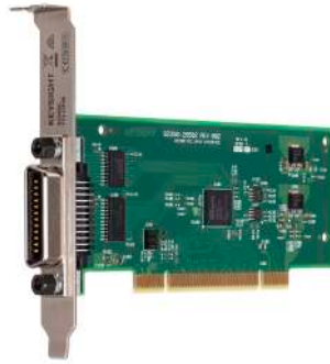
82350C with standard profile bracket

The 82350C interface card is fully compatible with IEEE-488 control and communication standard, de-couples GPIB transfers from PCI bus transfers. Buffering provides I/O and system performance that is superior to direct memory access (DMA). The hardware is software configurable and compatible with the plug-and-play standard for easy installation. The GPIB interface card offers high flexibility to plug into standard or low profile PC with a bracket change.