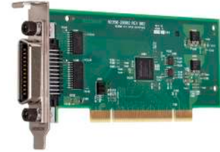
82350C with low-profile bracket