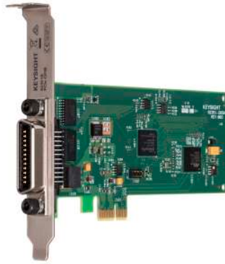
82351B with standard profile bracket

PCIe is the next generation of PCI and offers unsurpassed speed and performance, making PCIe cards an ideal choice for many computer platforms and automation applications. It is full backward compatible with PCI-configured software or coding, removing the need to reconfigure any code. The 82351B is highly flexible with plug-and-play configuration and enables usage in a low-profile PC with a bracket change.