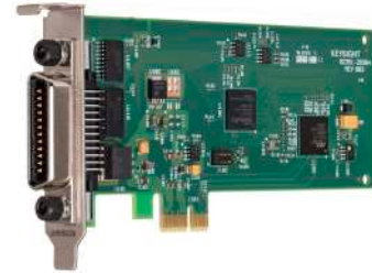
82351B with low-profile bracket