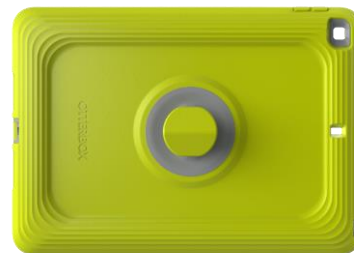
MARTIAN 77-81186 840104238714

Mobile gadgets for younger tech users need kid-specific protection. When teaching kids responsibility and exhibiting trust, we give them tablets and phones. Kids are kids and no matter how careful they want to be, accidents happen, plus, kids are just different than your average tech user. Ensure kids' tech is ready for anything with OtterBox Kids EasyGrab Tablet Case for iPad. Known for legendary protection, OtterBox designed EasyGrab Tablet Case especially for small hands. Made to prevail over tumbles. The case is designed for easy and frequent cleaning and sanitization. Included with EasyGrab Tablet Case is the innovative EasyGrab Multi-Use Case Stand designed for secure car travel, multiple hands-free viewing angles and convenient carrying on the go. Help kids grow their minds, grow their confidence and make the most of their iPads with OtterBox Kids EasyGrab Tablet Case. We've developed a 360° design approach just for kids. OtterBox Kids EasyGrab Tablet Case, OtterBox Kids Power and Audio Connector Cables and OtterBox Kids Blue Light Guard Glass Screen Protector work together seamlessly giving your kids an unprecedented set of tools designed specifically for how they stay connected. Give your kids independence and enhance their tablet experience with OtterBox Kids accessories.