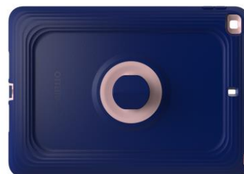
SPACE EXPLORER 77-81188 840104238738