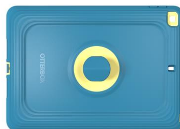
GALAXY RUNNER 77-81187 840104238721