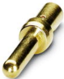
Crimp contact, turned, Single contact, contact diameter: 1 mm, crimp range: 0.08 mm 2 ... 0.22 mm 2

Please be informed that the data shown in this PDF Document is generated from our Online Catalog. Please find the complete data in the user's documentation. Our General Terms of Use for Downloads are valid ( http://phoenixcontact.com/download )