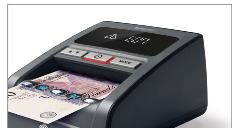
Suspected banknote alarm with visual and audio alert