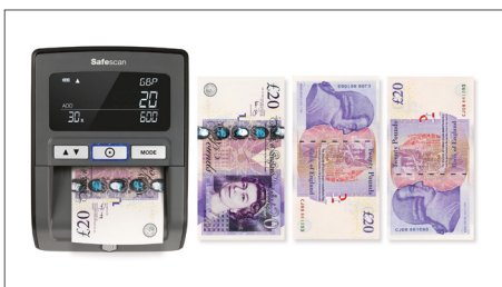
Insert British Pound banknotes in any direction