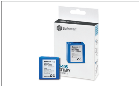
Safescan LB-105 Rechargeable battery Art. no: 112-0410