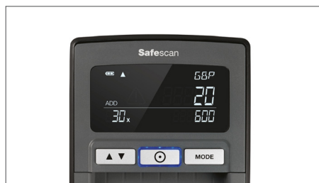
Shows quantity and totals