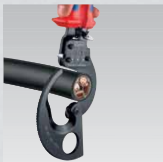
95 31 280: large cutting capacity: maximum 52 mm dia. / 380 mm 2