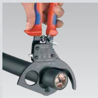
Ratchet principle and two-stage ratchet drive for easier cutting.