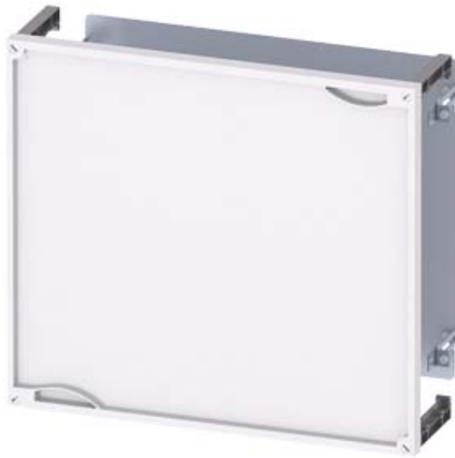
ALPHA 400/630 DIN, KIT MOUNTING PLATE WITH FIELD COVER WITHOUT CUTOUT H=450 W=500