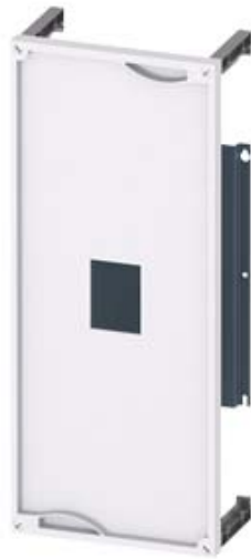
ALPHA 400/630 DIN, KIT FOR POWER CIRCUIT-BREAKER 3/4 POLE, 3VL400/630, H=600 W=250