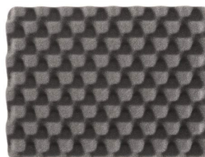
Cubed foam 2mm × 40mm / 2" × 1.57"