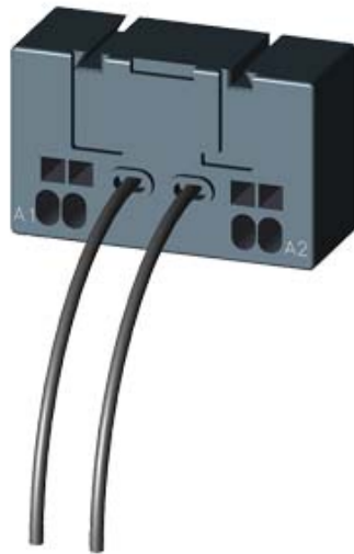
COIL CONNECTION MODULE FOR MOTOR CONTACTORS SZ S0, CONNECTION F. BOTTOM SPRING-LOADED TERMINAL