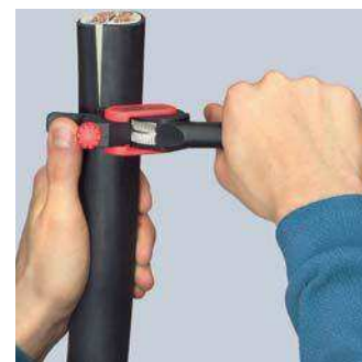
Turning the tool for circumferential cut