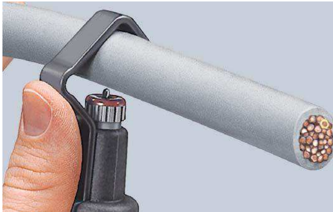
Setting the tool for circular cutting