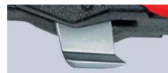
Adjustable cutting depth