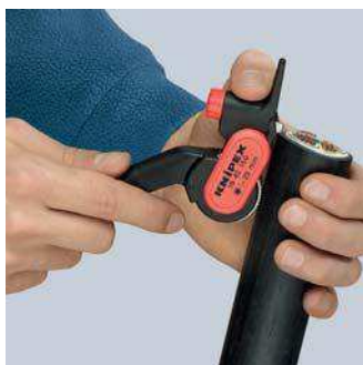
Setting the tool for longitudinal cut