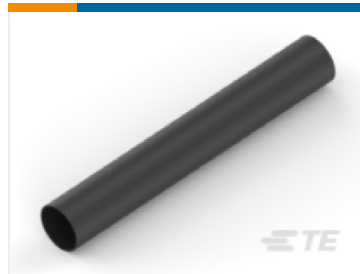
TE Part #NB09012001 ATUM-12/3-0-STK