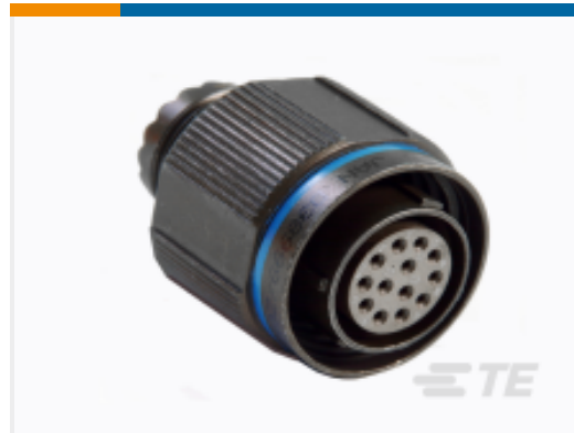
TE Part #YDTS26Z19-32PNV001 PLUG ASSY