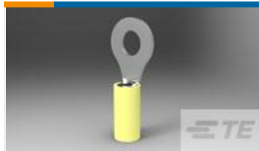
TE Part #320569 TERMINAL,PIDG R 12-10 1/4