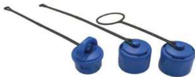
PXP4081 PXP4082 PXP4083