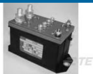
TE Part #1616058-6 A703CD (FAA/PMA)=RELAY