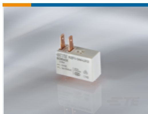
TE Part # 1833011-3 RZF1-1A4-L009