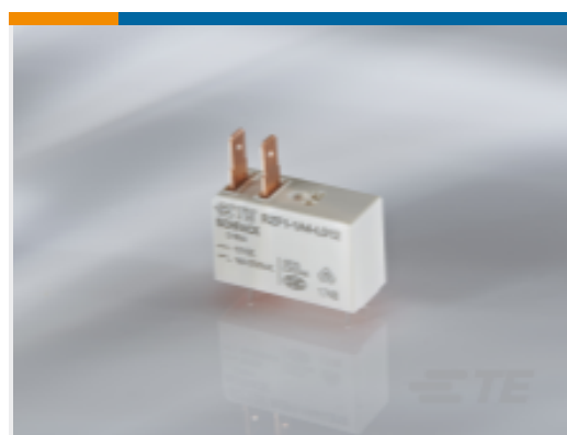
TE Part # 1833011-1 RZF1-1A4-L005