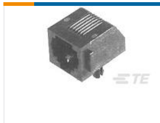
TE Part #5555163-5 MJ,LPF,R/A,6P/2C,PNL STOPS,BU