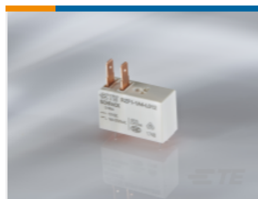
TE Part # 1833011-5 RZF1-1A4-L018