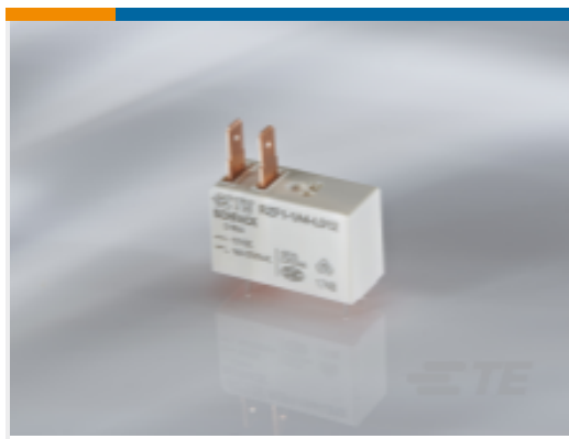
TE Part # 1833011-4 RZF1-1A4-L012