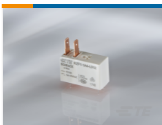
TE Part # 1-1833011-5 RZF1-1A6-L006