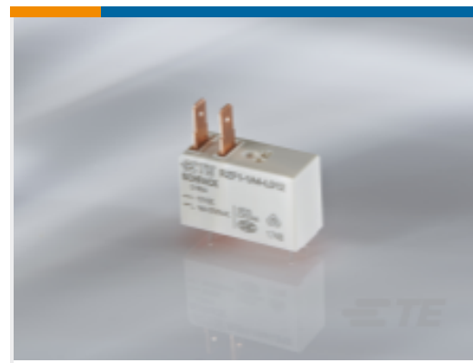
TE Part # 1833011-6 RZF1-1A4-L024