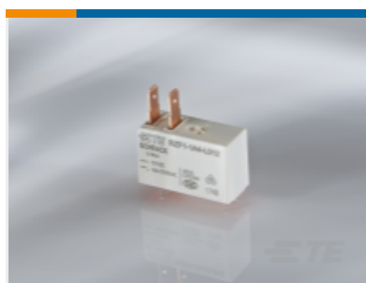
TE Part # 1-1833011-7 RZF1-1A6-L012