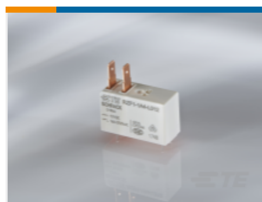
TE Part # 1-1833011-9 RZF1-1A6-L024