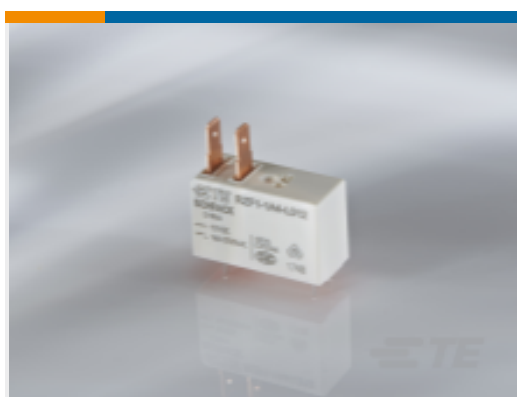
TE Part # 1-1833011-6 RZF1-1A6-L009