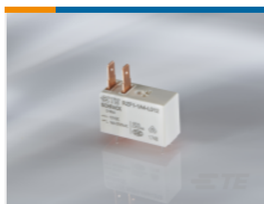
TE Part # 1-1833011-8 RZF1-1A6-L018