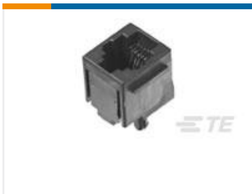
TE Part #216548-1 6/6 PCB MOD.JACK TE