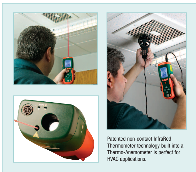
Patented non-contact InfraRed Thermometer technology built into a Thermo-Anemometer is perfect for HVAC applications.