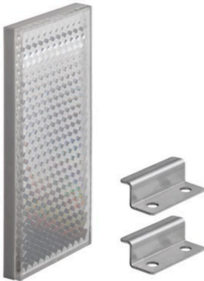
Part no.: 50130289 TK 50 x100-Set Reflector