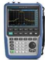
Spectrum analyzer R&S®FPH

The R&S®FPH can be combined with the R&S®HM6050-2 LISN and R&S®ELEKTRA software to create an economical EMI precompliance test setup for conducted measurements.