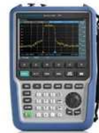
Spectrum analyzer R&S®FPH

With near-field probe (R&S®HZ-15/R&S®HZ-17) provides a quick EMI debugging solution for radiated measurements. It can be used with or without the EMI software.