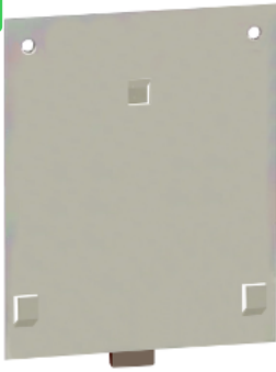
plate for mounting on Omega DIN rail - for voltage transformer