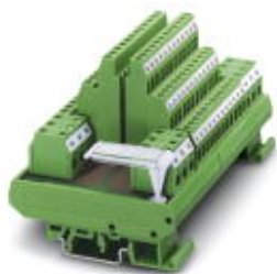
VARIOFACE module, with six equipotential busbars (P1, P2, P3, P4, P5, P6) for potential distribution, for mounting on NS 35/7.5 or NS 32

Please be informed that the data shown in this PDF Document is generated from our Online Catalog. Please find the complete data in the user's documentation. Our General Terms of Use for Downloads are valid ( http://phoenixcontact.com/download )