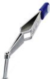
Positioning and unlocking tool for RC crimp contacts (D-SUB) for pin/socket, diameter: 2 mm

Please be informed that the data shown in this PDF Document is generated from our Online Catalog. Please find the complete data in the user's documentation. Our General Terms of Use for Downloads are valid ( http://phoenixcontact.com/download )