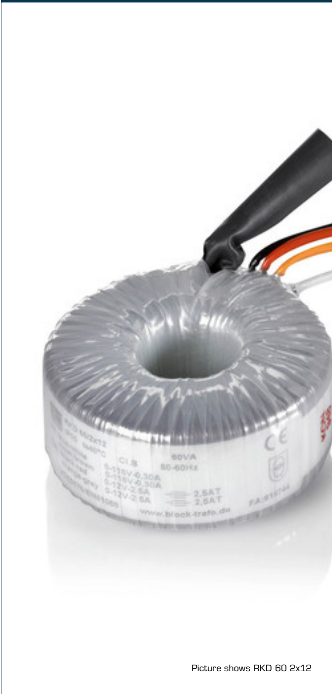
Picture shows RKD 60 2x12