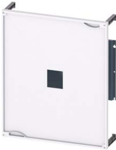
ALPHA 630 DIN ASSEMBLY KIT F. 3- AND 4-POLE CIRCUIT BREAKER 3VL630, H=600 W=500