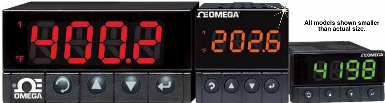
All models shown smaller than actual size.