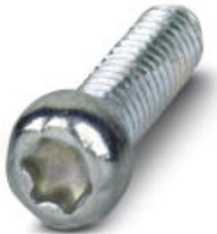
Anchor screw, self-tapping, for M23-PRO series angled device connectors

Please be informed that the data shown in this PDF Document is generated from our Online Catalog. Please find the complete data in the user's documentation. Our General Terms of Use for Downloads are valid ( http://phoenixcontact.com/download )