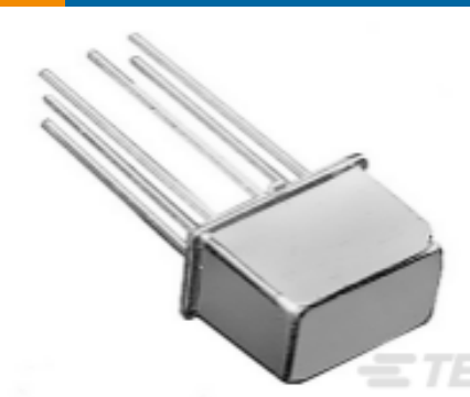
TE Part #1617147-5 JMGAP-26P = M39016/17-030P