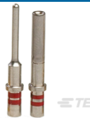
TE Part #ZPF000000000001261 097-0267-16 A1267