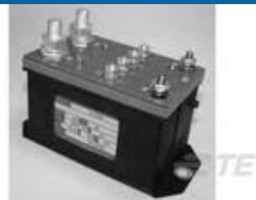
TE Part #1616058-6 A703CD (FAA/PMA)=RELAY