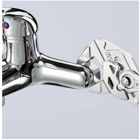
Working on plated fittings without damage of the surface