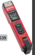
IR-450-EUR Article no. 4308539

Included: 1x IR-450-EUR, 1x Battery 1.5 V, IEC LR03, AAA, 1x User manual