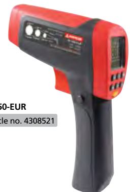
IR-750-EUR Article no. 4308521