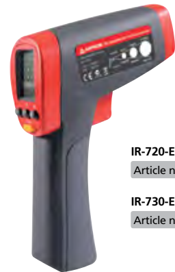
IR-720-EUR Article no. 4308500