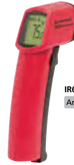
IR608A Article no. 3015690

Included: 1x IR608A, 1x Battery 9 V, IEC 6LR61, 1x User manual