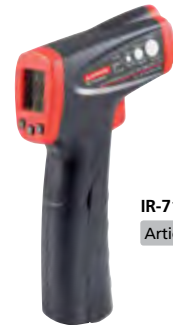
IR-710-EUR Article no. 4308480