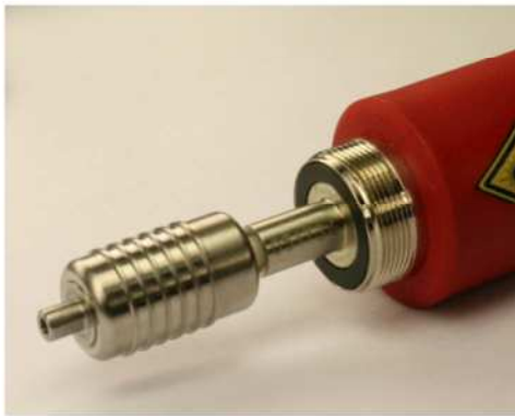
FIBERPOINT® 250 with Adapter