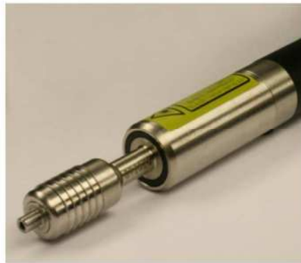
FIBERPOINT® 250MD with Adapter