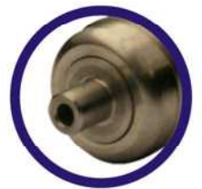
1.25 mm side