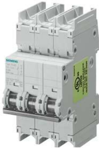
CIRCUIT BREAKER 240V 14KA, 3-POLE, D, 20A, D=70MM ACC. TO UL 489