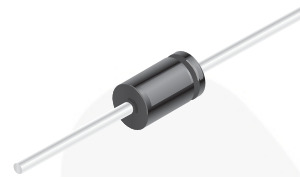
DO-41 (Plastic) COLOR BAND DENOTES CATHODE