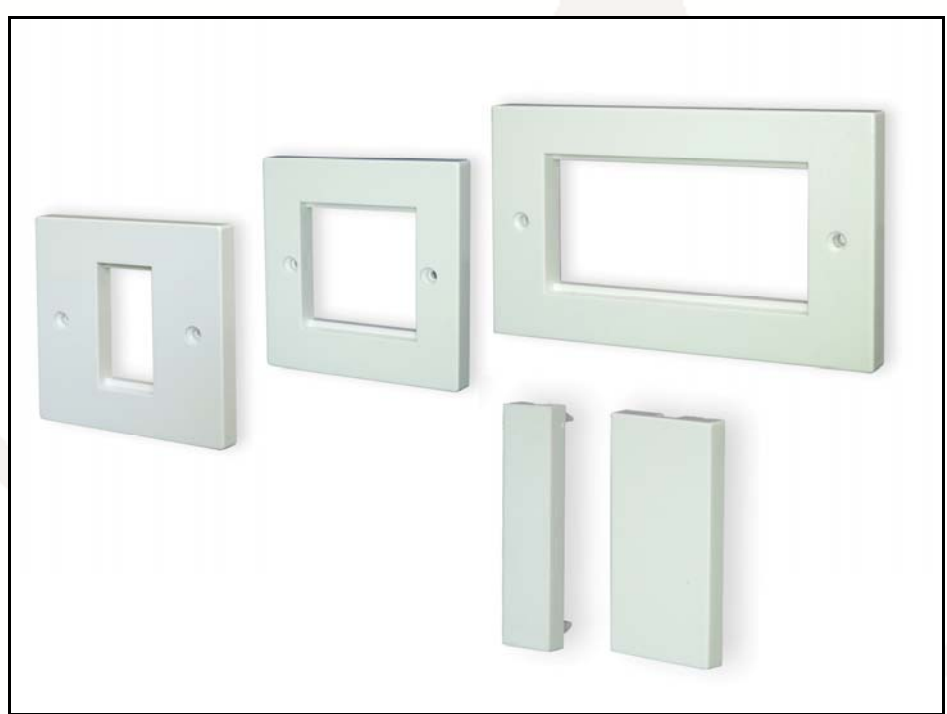
'Euro Style' Faceplates KPH1wh, KPJ2wh, KPL4wh, KPR0.5wh, KPR1wh

'Euro Style' Faceplates KPH1bk, KPJ2bk, KPL4bk, KPR0.5bk, KPR1bk