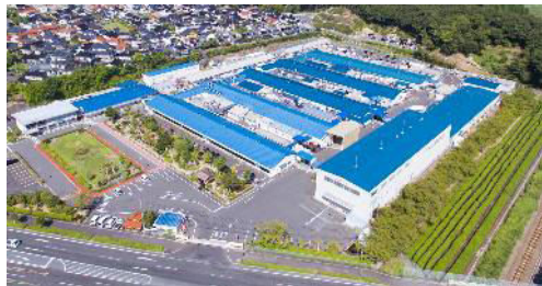
Iwami factory (Hane)