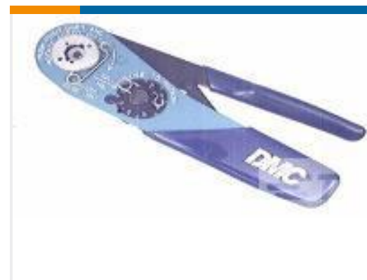
TE Part # 601966-1 CRIMPING TOOL M22520/2-01