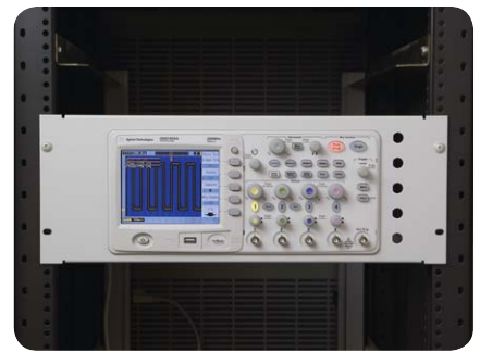
Rackmount kit for 1000 Series