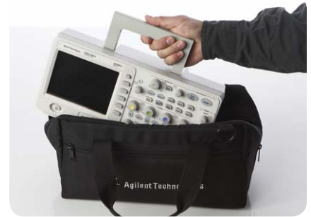
Soft carrying case for 1000 Series