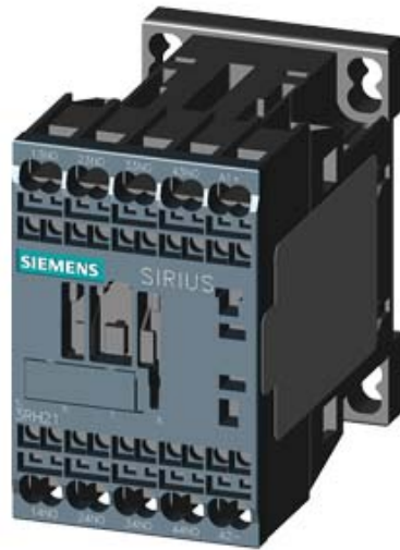
CONTACTOR RELAY, 4NO, DC 48V, SZ S00, SPRING-LOADED TERMINAL