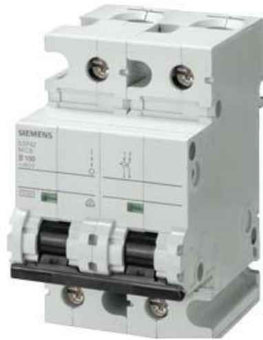
CIRCUIT BREAKER 400V 10KA, 2-POLE, D, 100A, D=70MM