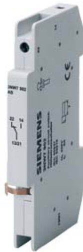
CONTROL SWITCH 1NO+1NC FOR CYLINDRICAL FUSE BASE SIZE 22X58 MM