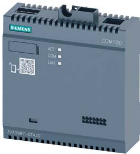
BREAKER DATA SERVER COM100 ACCESSORY FOR: 3VA