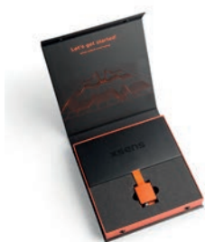
MTi 10-series Development Kit: MTi, software and cabling