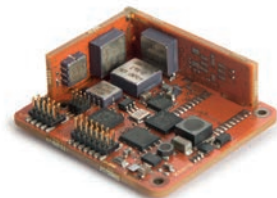
MTi OEM: 37x33x12 mm, 11g, 16-pins header