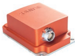
MTi encased: 57x42x23.5 mm, 52g, 9-pins push-pull connector